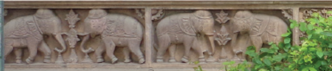
Pool View, Railway Headquarters Building, Gwalior